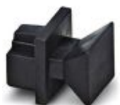
Dust protection caps for RJ45 socket

Dust protection - FL RJ45 PROTECT CAP - 2832991