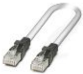
Patch cable, CAT5, assembled, 2 m

Patch cable - FL CAT5 PATCH 2,0 - 2832289